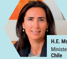
H.E. Ms. Carolina Schmidt Minister of Environment, Chile