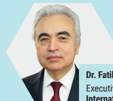
Dr. Fatih Birol, Executive Director, International Energy Agency