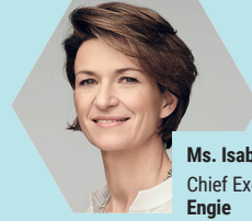
Ms. Isabelle Kocher Chief Executive Officer, Engie