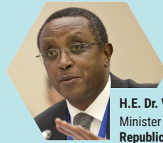
H.E. Dr. Vincent Biruta, Minister of Environment, Republic of Rwanda